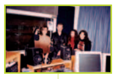
Practice at the radio station 'Ciao FM'

Practice at the radio station 'Sport radio'