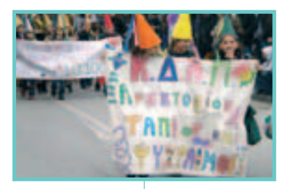
Children parade from the Anaktorio Center of Creative Activities for Children